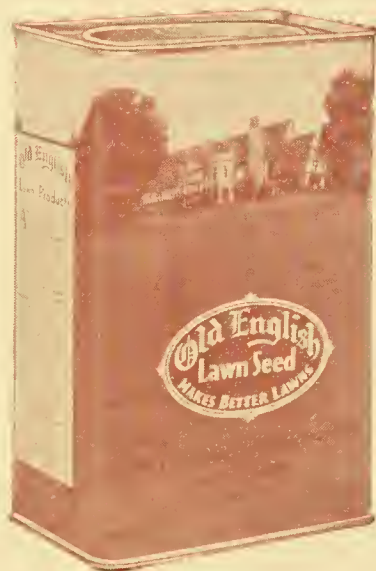
The above illustrates the attractive canister in which Old English Lawn Seed is packed in 1-lb., 2-lb. and 5-lb. sizes.